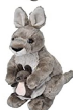
Keep on trying Kangaroo