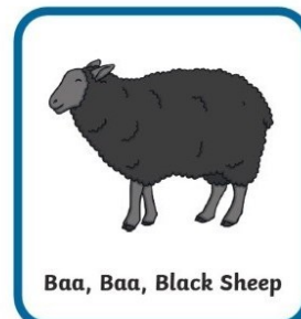
Baa, Baa, Black Sheep