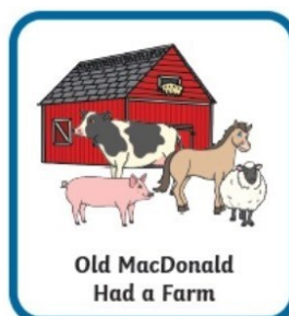
Old MacDonald Had a Farm