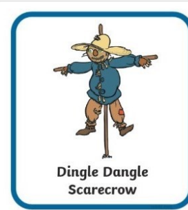
Dingle Dangle Scarecrow